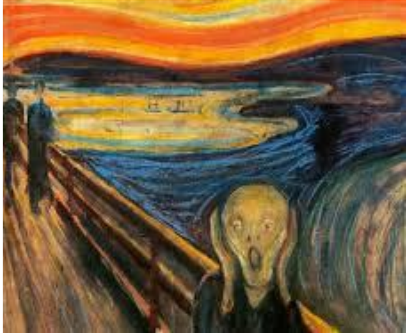
The Scream by Edvard Munch